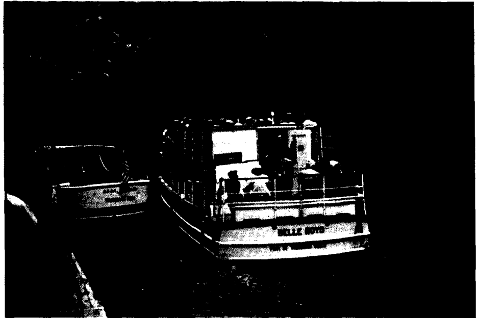
Clayton — Ambassador College